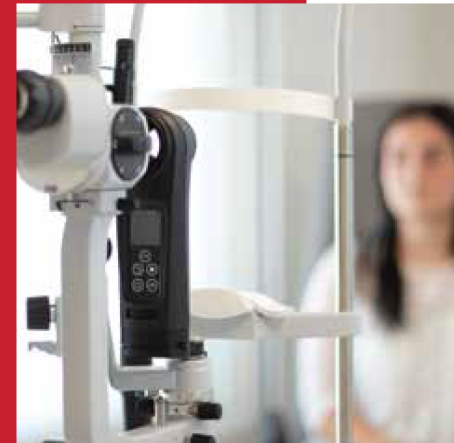
THE MODERN WAY: CXL AT THE SLIT LAMP